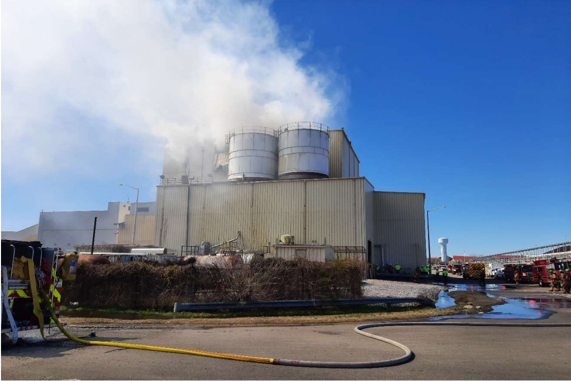
#3 – Looking at east side of pelletizer building. Smoke emanating from building. Water runoff observed from firefighting activities.