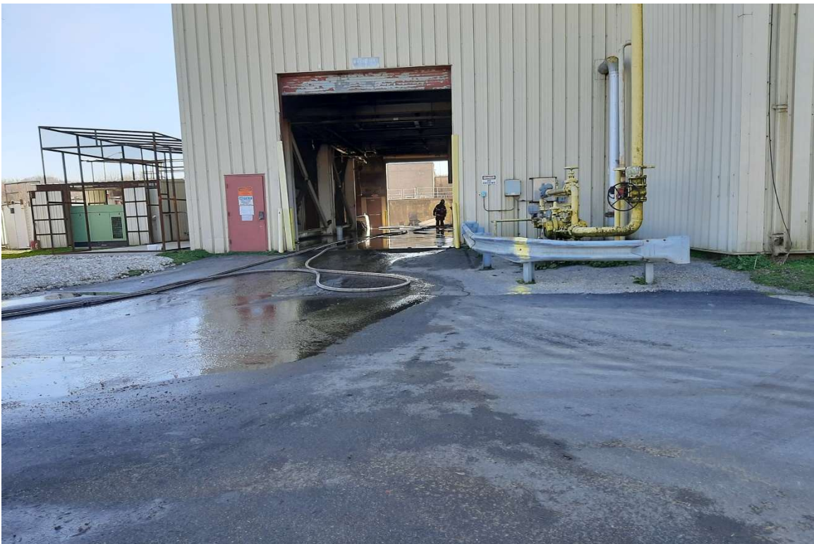
#6 – View of contaminated water exiting the pelletizer building.