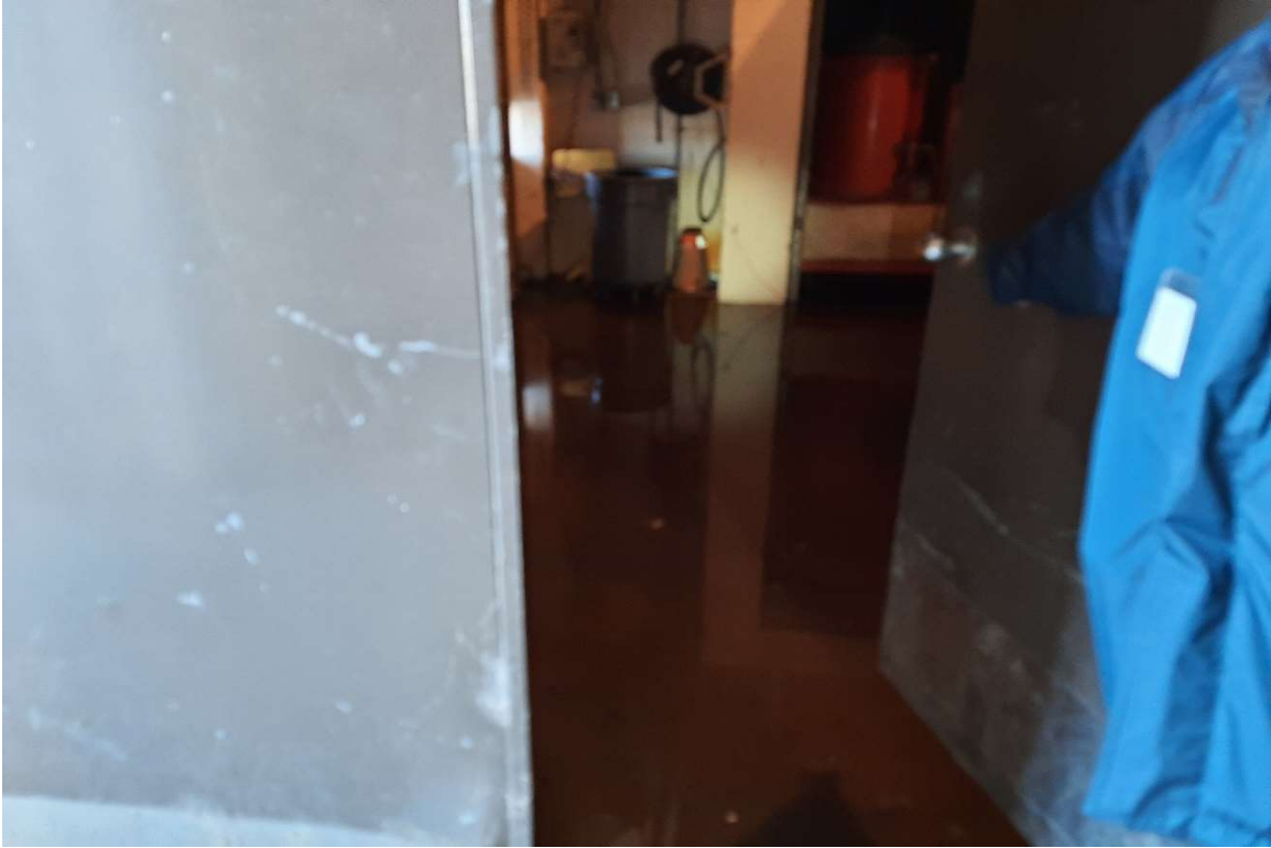
#15 – Contaminated water inside the truck loading building.