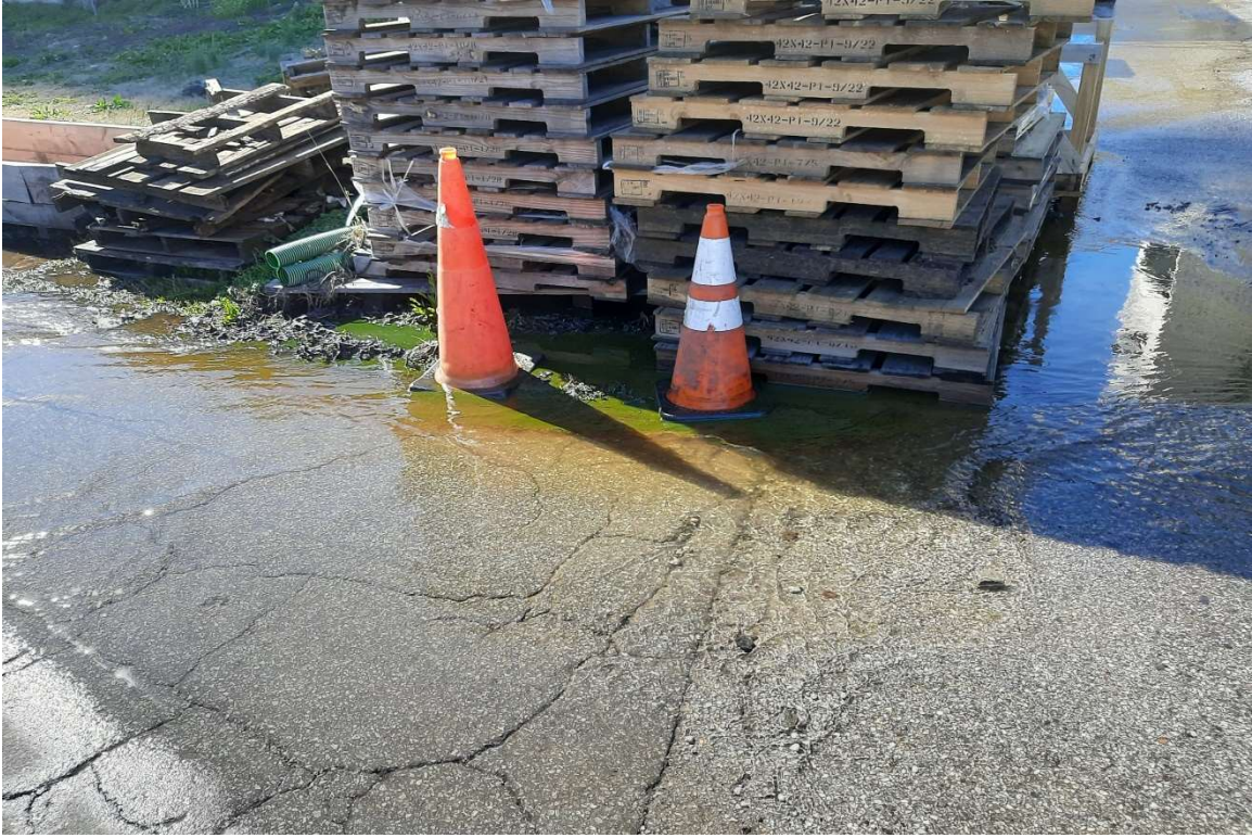
#17 - View of contaminated water.