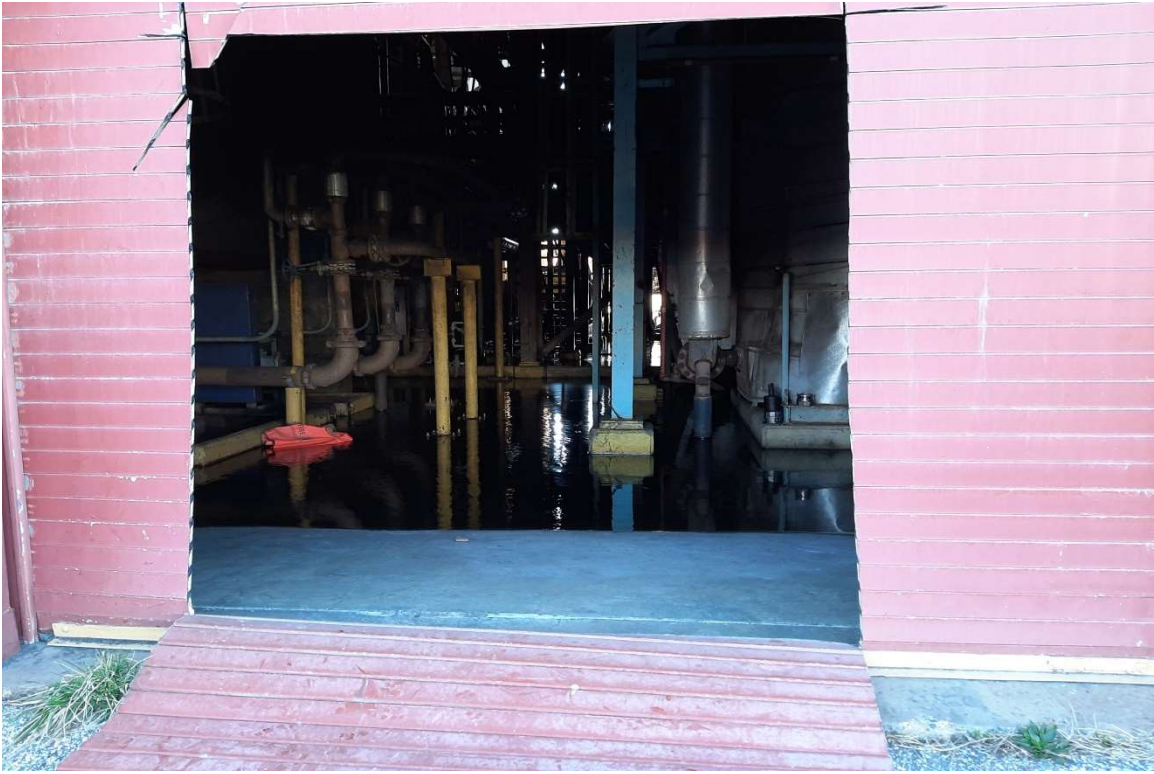
#5 – View of water in first floor of pelletizer building.