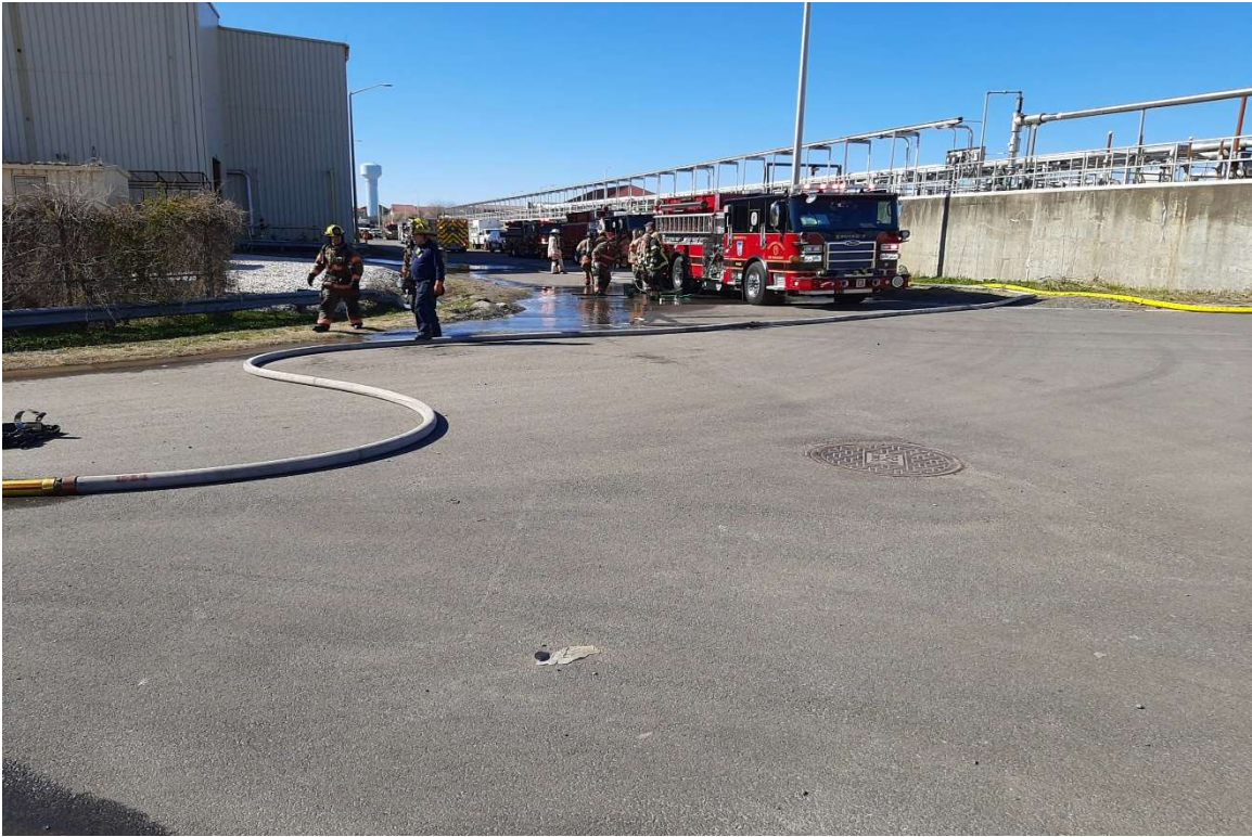
#7 – View of contaminated water flowing away from building along pavement.