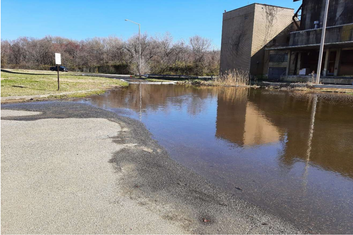
#13 – View of contaminated water as it flows down to the rear of the truck loading building.