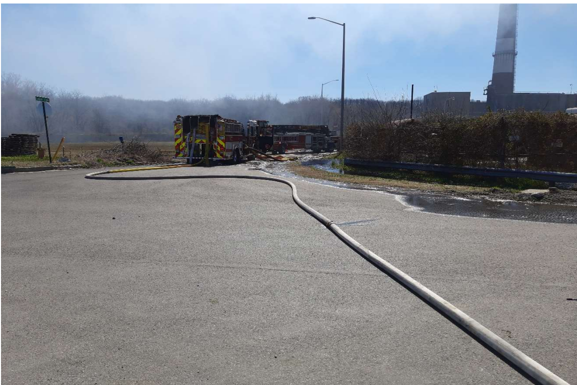
#8 – View of fire truck hooked up to fire hydrant and potable water flowing out of truck onto the pavement.