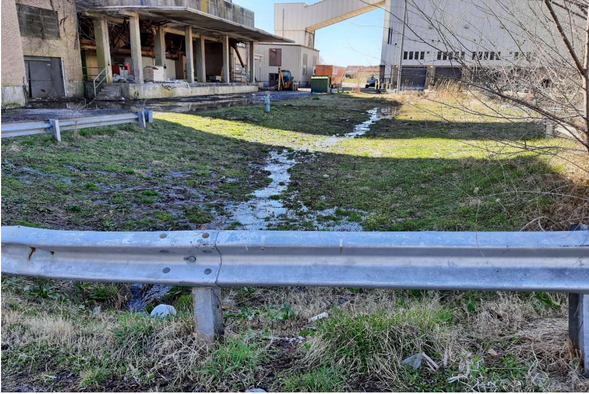
#11 – More contaminated water entering a drainage channel to a culvert.