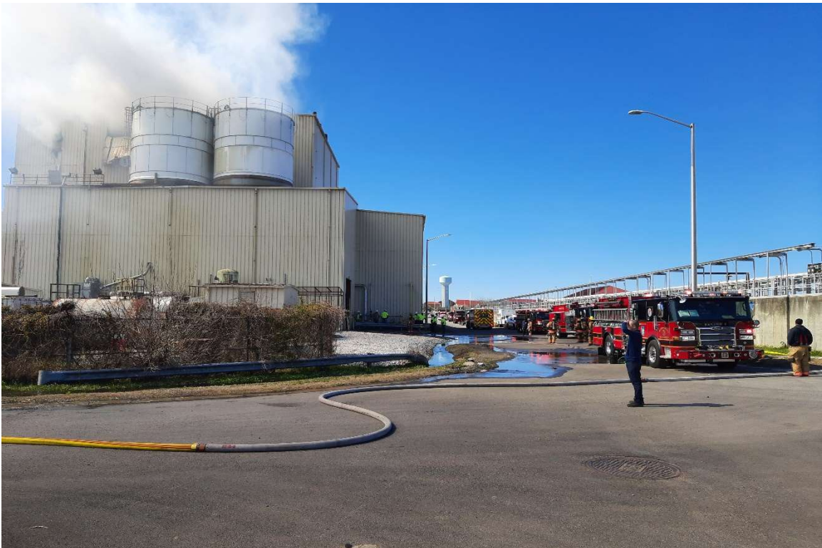
#4 – Another view of smoke emanating from the building.