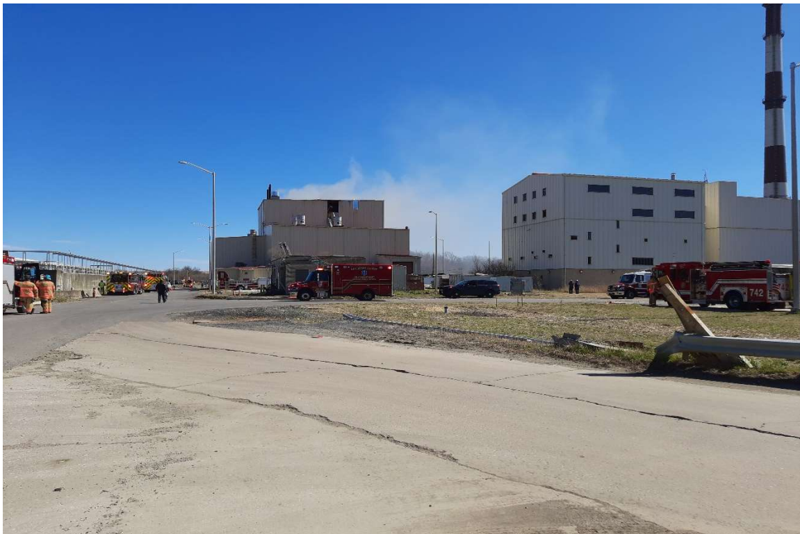
#2 – View of smoke emanating from pelletizer building.