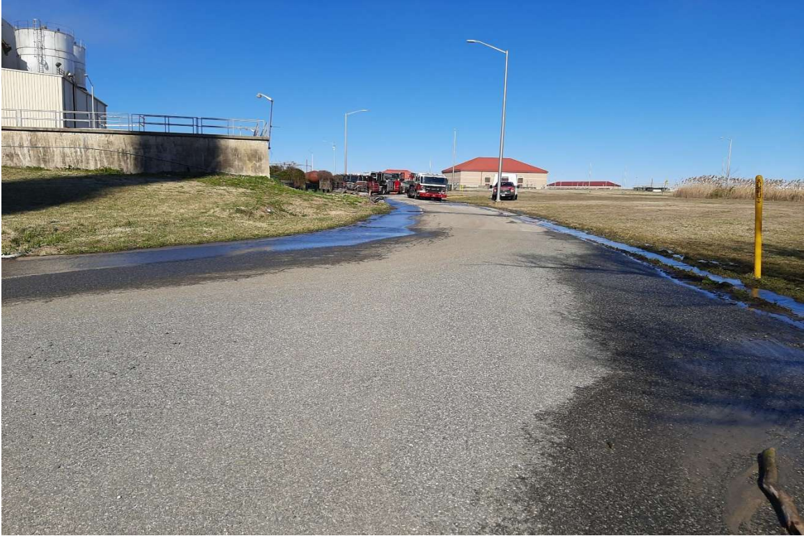
#9 – Contaminated water continues to flow along pavement down towards truck loading building.