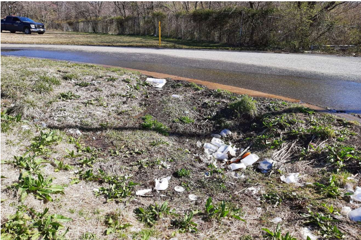
#10 – Some of the contaminated water leaves the pavement and flows onto a vegetated area and into a culvert.