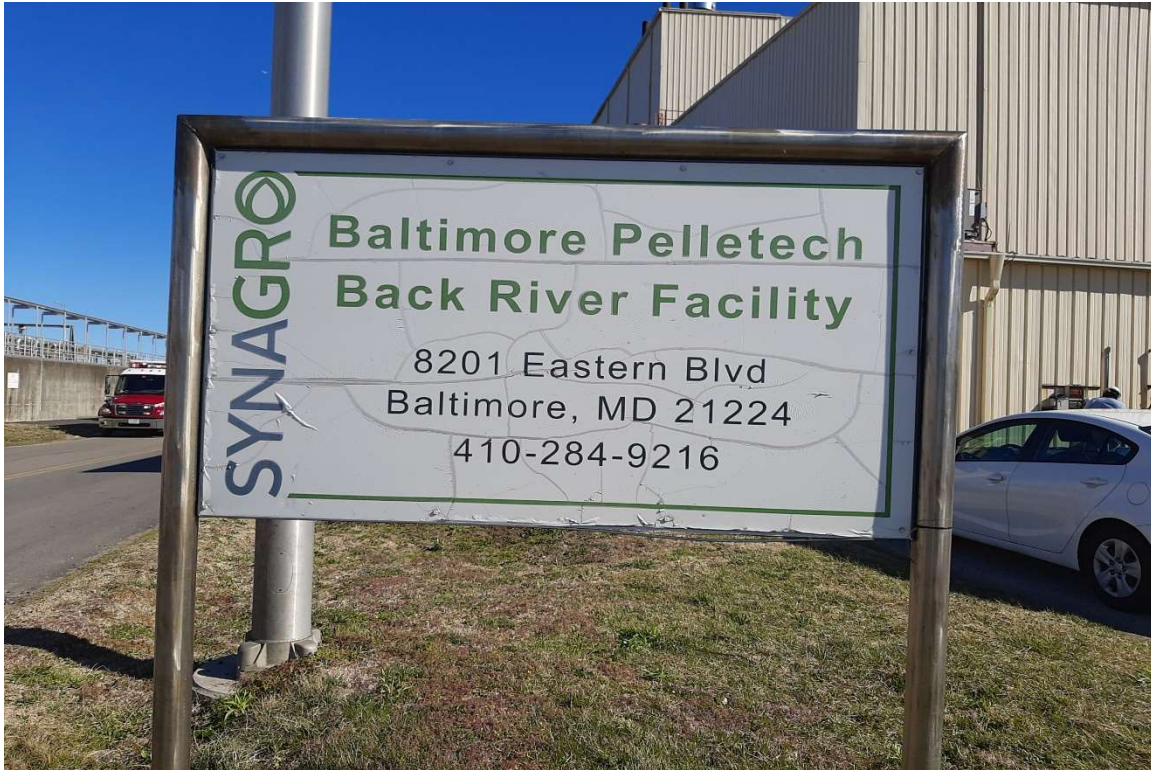
#1 – Synagro pelletizer building sign.