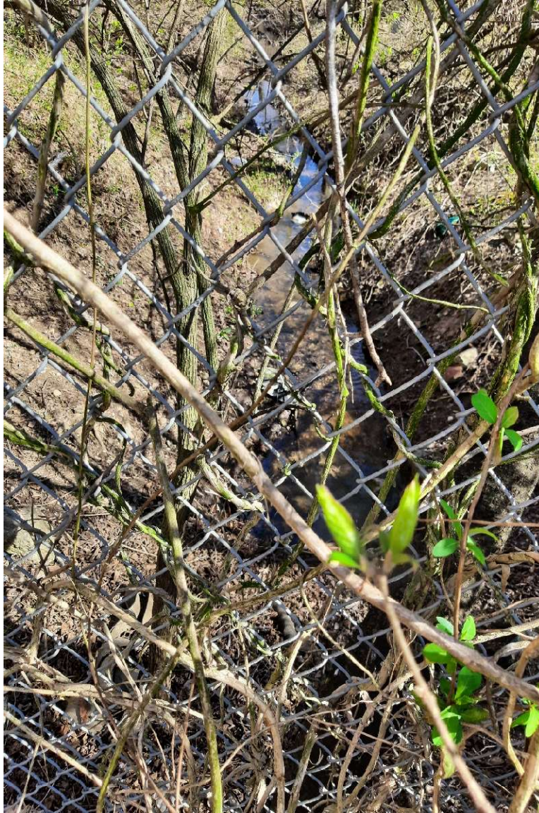
#12 – The culvert discharges to a wetland area that is adjacent to Bread & Cheese Creek.