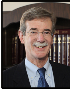
BRIAN E. FROSH ATTORNEY GENERAL

MARYLAND OFFICE OF THE ATTORNEY GENERAL 410-576-6300 1-888-743-0023 TOLL-FREE TDD: 410-576-6372